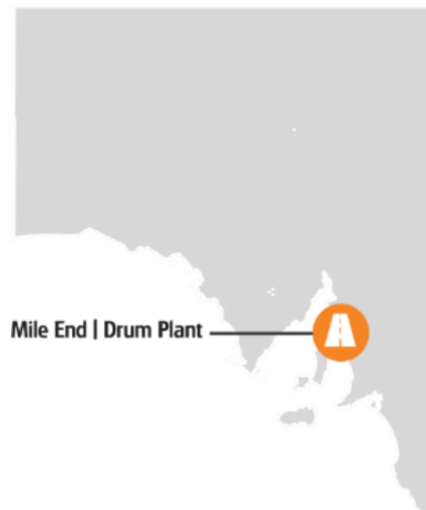
Figure 4 - Location of Fulton Hogan's asphalt production facility included in this EPD

The processes in modules A1-A3 have been modelled to represent asphalt production in Mile End, near Adelaide, South Australia. The raw materials are sourced globally (e.g. bitumen) and from within Australia, and the end-of-life (module C) of the product has been modelled to represent Australia (based on the EPD Australasia 2022 default scenario for metropolitan roads).