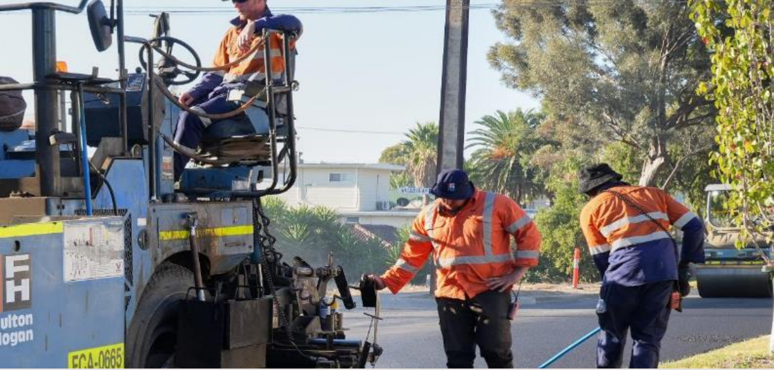
Figure 1 - Fulton Hogan manufacturing and quarrying capabilities