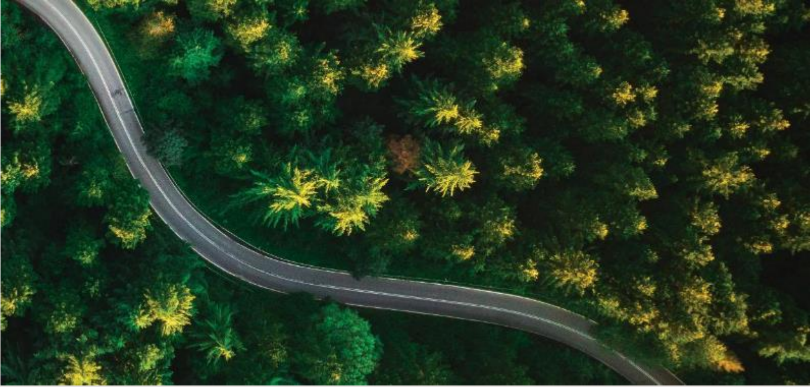
Figure 2 - Fulton Hogan's Group Sustainability Framework