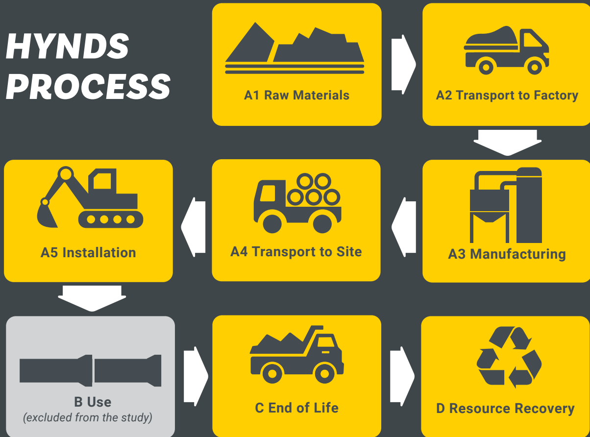
Diagram of Hynds process