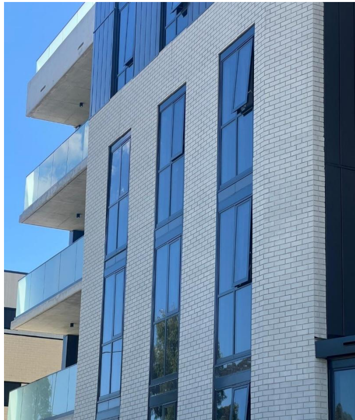
The photo shows an example of precast panels (in this case with brick-profile surfacing) produced by Teggman Precast. Note: this EPD is for the ready-mixed concrete supplied to Teggman Precast.

Programme: The International EPD® System www.environdec.com Programme operator: EPD International AB Regional Programme: EPD Australasia www.epd-australasia.com EPD Registration no. EPD-IES-0024884:001 Issued 2025-07-15 | Version: 2025-07-15 | Valid until 2030-07-15 Geographical scope: Australia